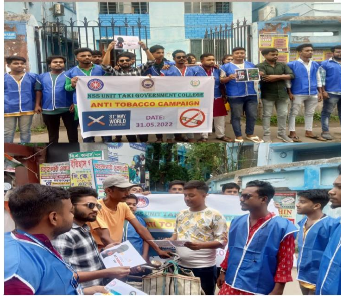
Involvement of students in anti-tobacco campaign on 31st May, 2022