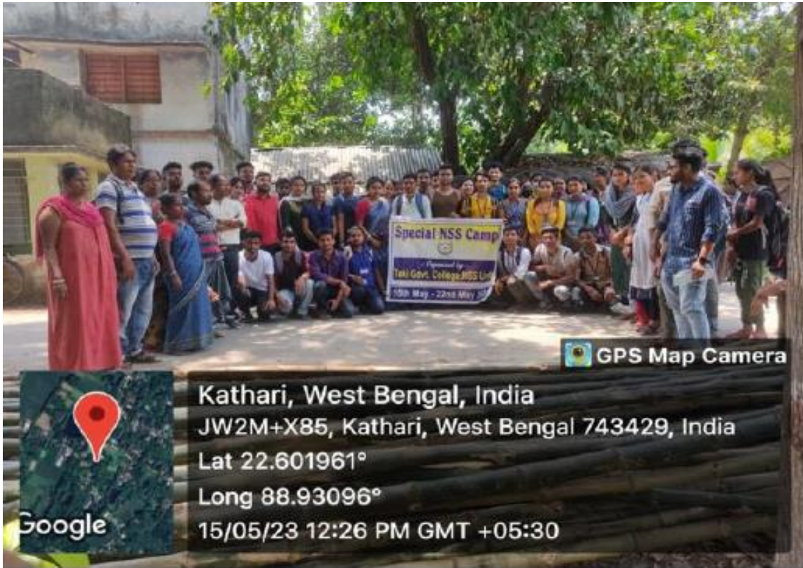
Adoption of local village Kathari