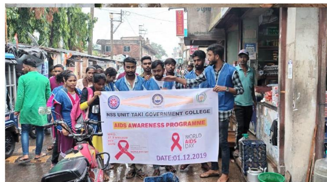
Involvement of students in AIDS Awareness Campaign on 1st December, 2019