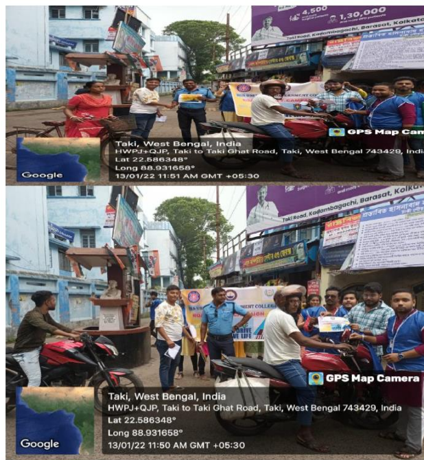
Awareness campaign on road safety on 13th January, 2022